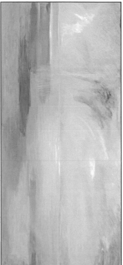
"Everchanging Light" by Shirley Mossman Nisbet.

range of colors, some soft white, some in grays and rose, and others bold mixtures of blues and reds, they all have similar compositional elements. There is a central area of light that draws the eye deep into the picture plane. Intriguing bold strokes, paint drips, or textures then allow one's eye to travel back to the surface.