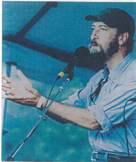
At Falcon Ridge